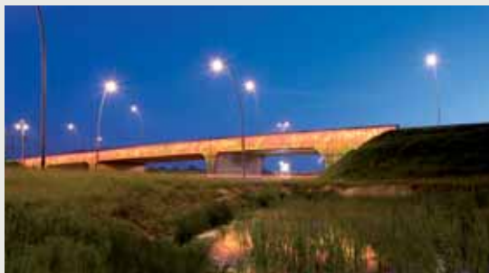
Figure 2: Bridge Lighting in Eindhoven 22

An innovative deployment of SSL in Eindhoven is the use of colour to provide safety information and to reduce environmental impact. Coloured lights have been installed in the pavements as auxiliary safety indicators to better highlight pedestrian and cyclist crossings in the city, and low intensity green lighting has been deployed on rural cycle paths to improve visibility and minimise impact on the local fauna.