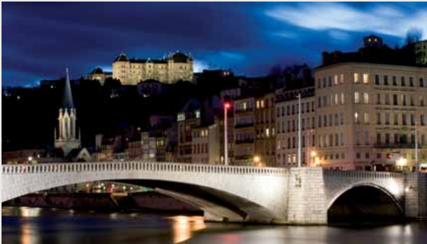
Figure 5: Lyon city centre 24