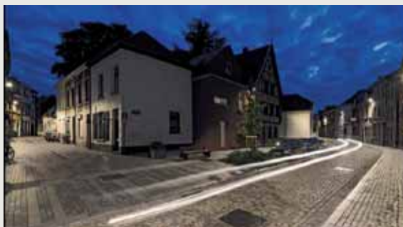
Figure 4: Mechelen's street lighting

The city of Mechelen has over 10,000 street lights installed with a total electricity consumption of more than 4.4 million kWh per year. In the city centre, traditional street lighting has been replaced in stages between April and June 2012 by 577 innovative high-quality LED lighting units spread over 90 streets. LED lighting has brought great improvements in safety, the environment and the general ambience. The new lighting units result in expected energy savings of 37% and have much longer lifetimes (approximately 60,000 hours). The installed system is future-proof and can easily be upgraded to keep pace with the rapid evolution of LED technology, which will permit additional energy savings. The project was implemented by the Flemish regional electricity distribution network operator Eandis.