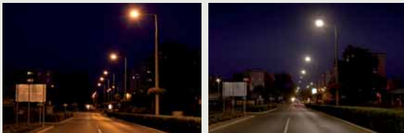
Figure 3: Kaszap Road, replacement of HPS by LED

In 2010 and 2011 more than 6,000 new LED street lighting luminaires were installed in the city of Hódmezővásárhely. The energy savings achieved are 35% and the new lighting solution is nearly maintenance free. Through the new SSL solution the lighting levels and the overall visual comfort and feeling of safety have been significantly increased.