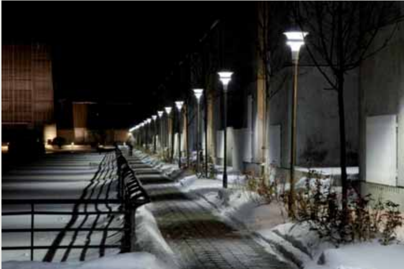
Figure 7: Albertslund street lighting

The municipality of Albertslund, located in the wider Copenhagen area, has adopted a new lighting plan which is solely based on LED technology. The plan includes the development and testing of different street lighting designs and Wi-Fi based smart control systems. In recent years, the town has contributed to the invention of several outdoor lamps, in close cooperation with designers and manufacturers; noteworthy is the award winning “A-lamp”. Today, the first stage of a “Scandinavian Lighting and Photonics Science Park” is under development in Albertslund, with the ‘Danish Outdoor Lighting Lab’ (DOLL) as the driving force. Copenhagen, the European Green Capital 2014, will invest € 40 million to replace 21,000 street and traffic lights with SSL by 2015.