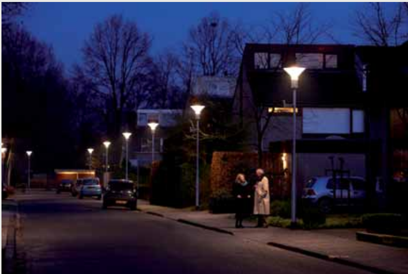
Figure 6: New LED lighting in Tilburg